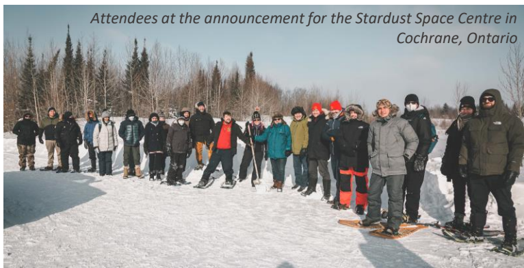
Attendees at the announcement for the Stardust Space Centre in Cochrane, Ontario

Canada Nickel also signed a non-binding memorandum of understanding with the Cochrane Board of Trade on February 25 th . This MOU outlines the potential for mutual support and collaboration on initiatives, partnerships, and Canada Nickel's community engagement activities in Cochrane.